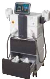
Ref. M92 * CRIOCUUM optional table