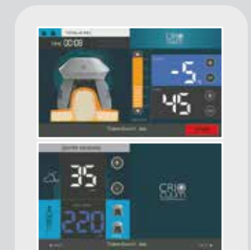
INTUITIVE SOFTWARE FOR THE TREATMENT CONFIGURATION