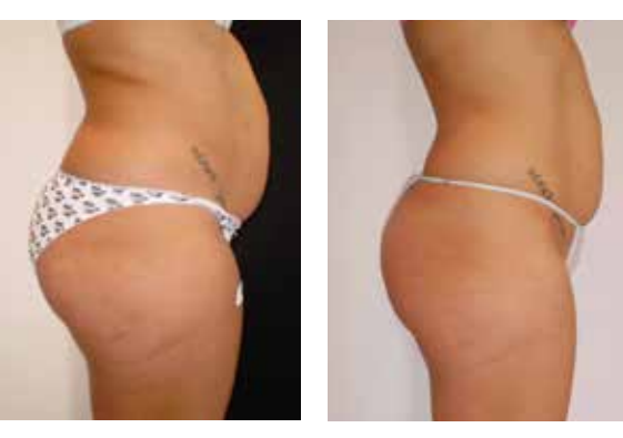
Abdomen modelling. Localised fat reduction. 10 sessions